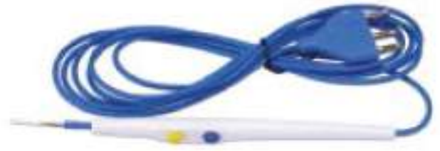
DISPOSABLE HAND SWITCH PENCIL