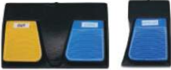
MONOPOLAR / BIPOLAR FOOT SWITCH