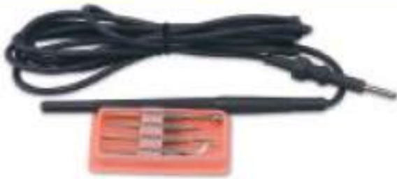
CHUCK HANDLE WITH ELECTRODES