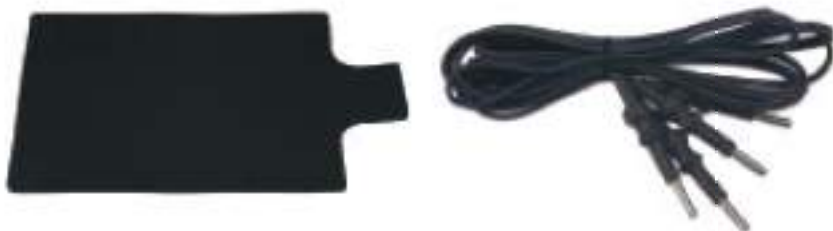
SILICON PATIENT PLATE WITH CORD