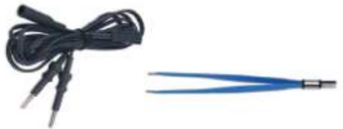
BIPOLAR FORCEP WITH CABLE